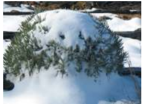
Anyone for lavender snow ice cream?